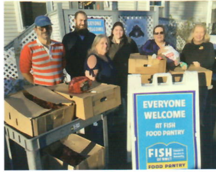
Dymax helps FISH with Thanksgiving