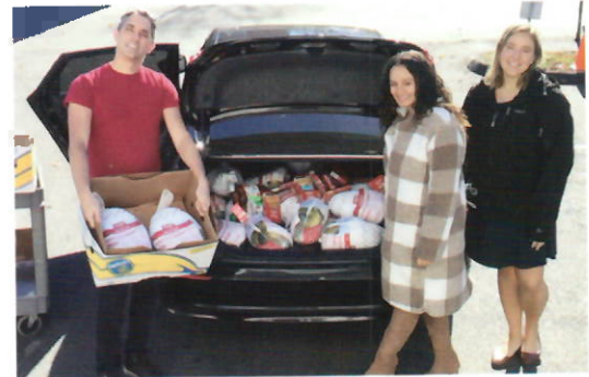
Leadership NW raises 50 turkeys for Thanksgiving!