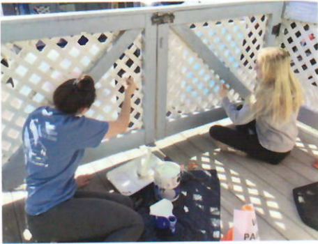
NCCC Criminal Justice students