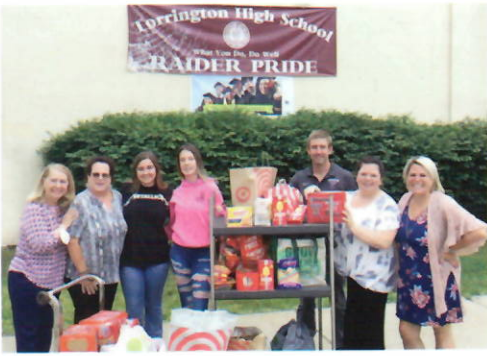
Raiders Rally Day