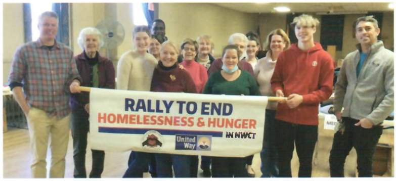
Super volunteers at our 8th Rally and coat giveaway