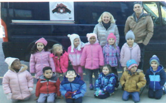
Food raising by Torrington School Kiddos