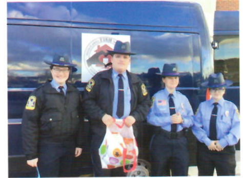
State Police Cadets "raise food"