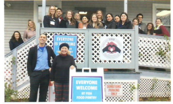
NWCT Chamber of Commerce "Leadership NW" at FISH